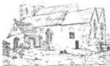
St. Nicholas - Boughton Malherbe